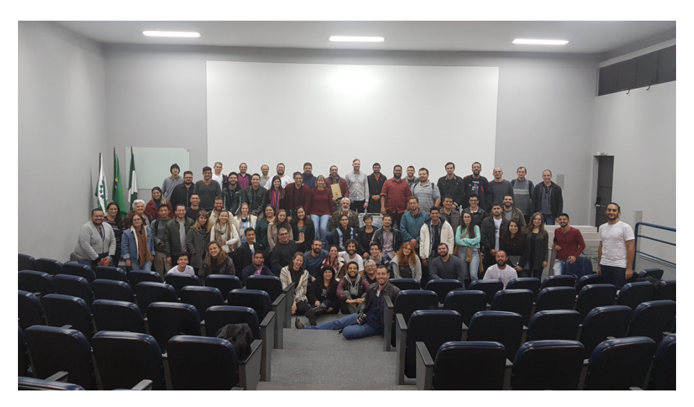
Figure 5: Some participants of R Day after the closing session.