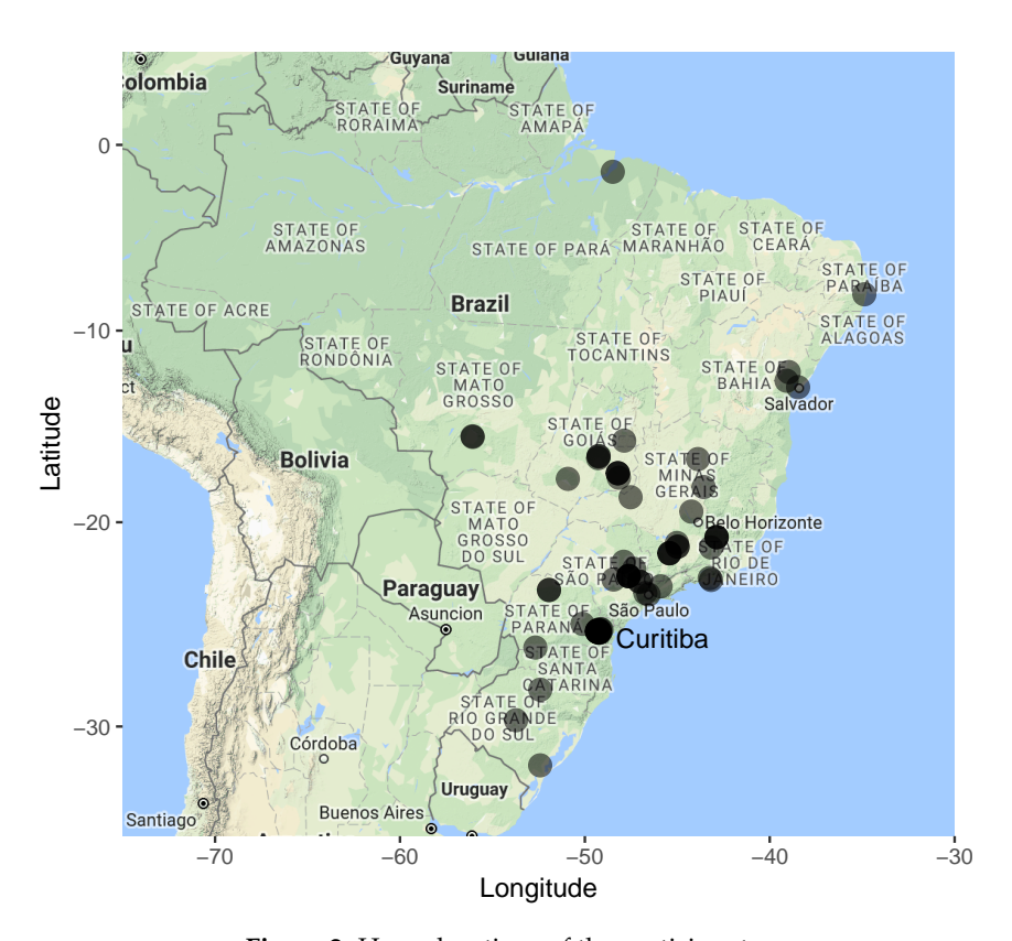
Figure 2: Home locations of the participants.