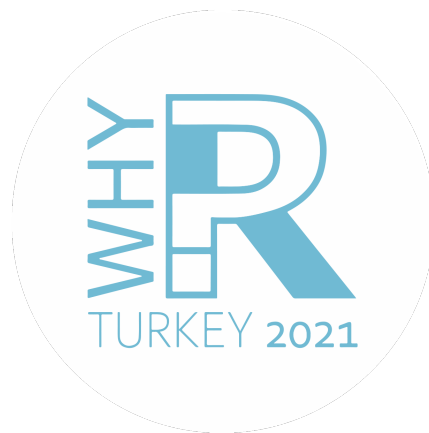
Figure 1: The logo of Why R? Turkey 2021.

The Why R? Turkey 2021 is a pre-meeting of Why R? 2021 conference. Why R? conferences are international conference series organized annually by the Why R? Foundation since 2017. It is one of the largest annual R conferences in Central Europe (Burdukiewicz et al., 2019). In addition to the main conference, pre-meetings are held in different cities from all over the world. In 2017, four pre-meetings were organized in Poland. Thereafter, eleven pre-meetings across four different countries were held in 2018. In 2019, twelve pre-meetings took place in eight different countries. In 2020, in a pre-meeting framework, totally six organizations appeared in four different countries (Poland (2), Turkey (2), Ireland (1), and Germany (1)). Among those six pre-meetings, two of them were held in Istanbul (24.04.2020) and Ankara (27.04.2020) consecutively, as a one-day organization (Why R, 2020).