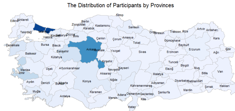
Figure 2: The Distribution of Participants by Provinces

Most of the participants were registered from İstanbul, Ankara, and İzmir, respectively. In the conference, we had participants from 73 provinces out of 81 provinces in Turkey. The distribution of registered participants by provinces is illustrated in Figure 2.